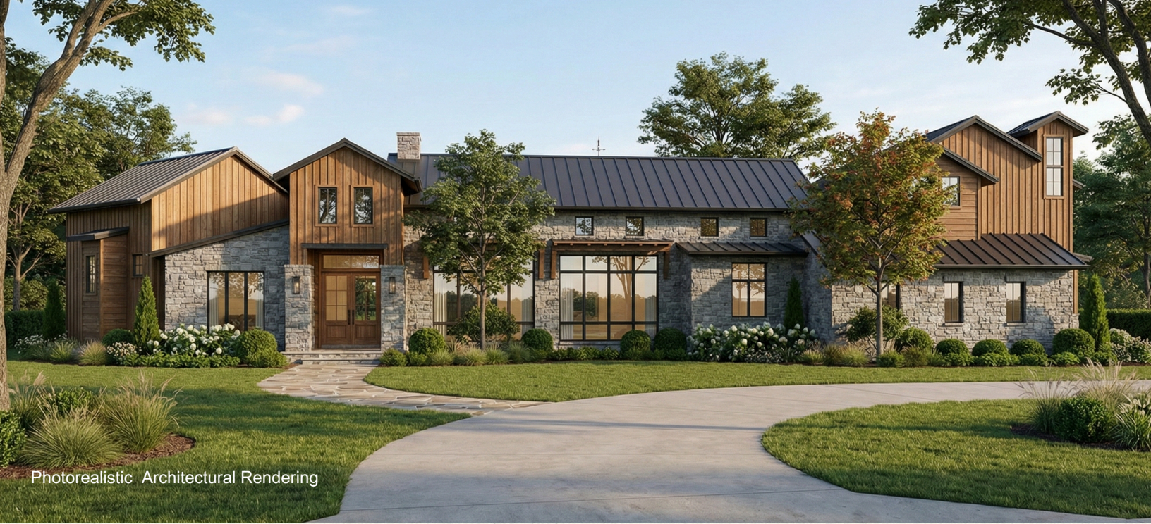
Photorealistic Architectural Rendering

Brookten Farm | 4,112 Sq. Ft. | Heated & Cooled 4 Bedrooms | 4.5 Baths | 3-Bay Auto Storage (Garage) Modern Farmhouse | Open Concept | Estate-Lot Presence