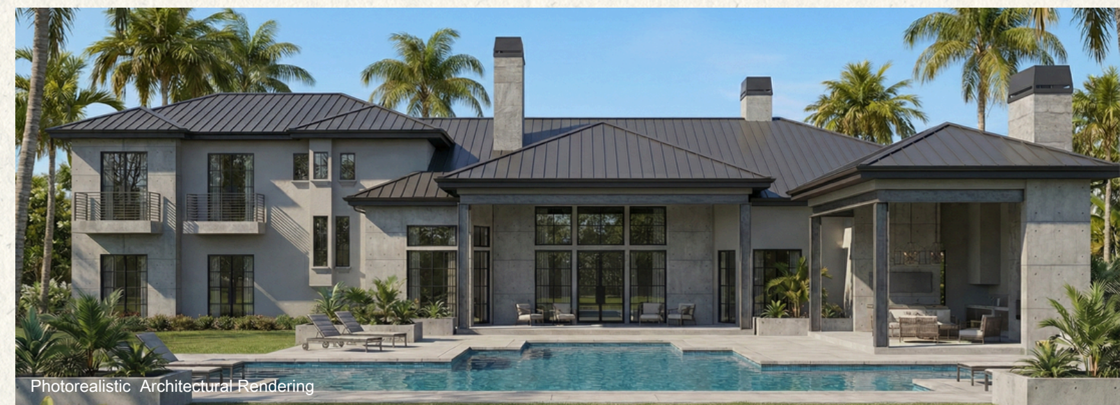
Photorealistic Architectural Rendering

Refined estate living with private owner's comfort, generous gathering spaces, and quiet upstairs retreat.