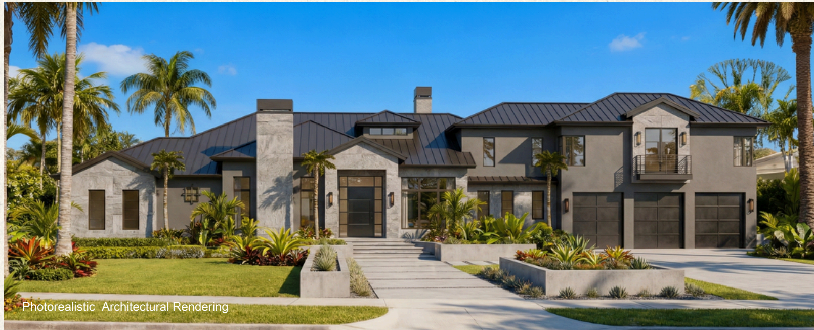
Photorealistic Architectural Rendering

Refined estate living with private owner's comfort, generous gathering spaces, and quiet upstairs retreat.