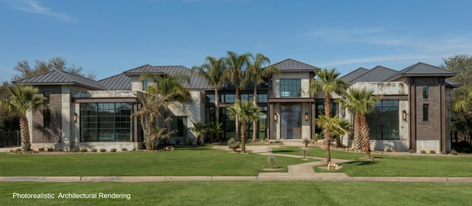
Photorealistic Architectural Rendering